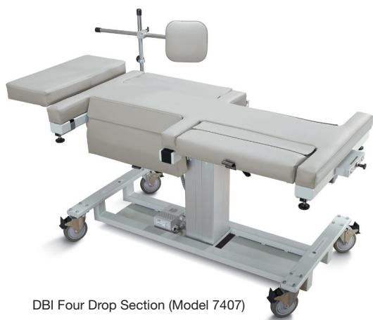
DBI Four Drop Section (Model 7407)